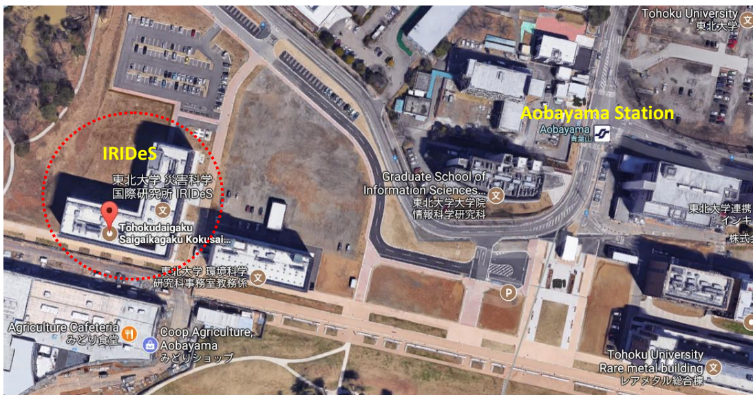
November 26 Afternoon/ 4ACUDR Opening and Full-Paper Presentation Sessions/ IRIDeS